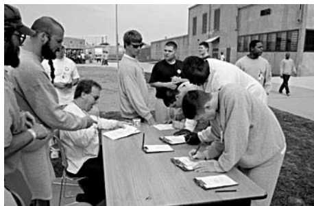
At FDCF, CROP Walkers registered and wrote "Store Orders" to contribute and witness by walking.