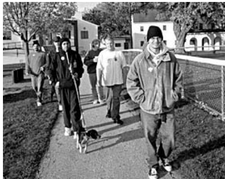
At NCCF, 13 walkers and a couple of dogs walked together to witness to others that they walk because they