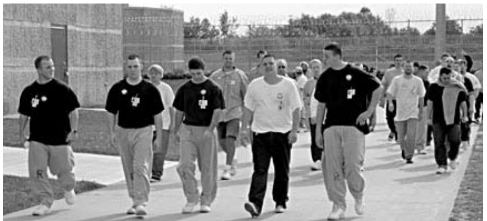
About 63 CROP Walkers circled the yard sidewalk nine times at FDCF.