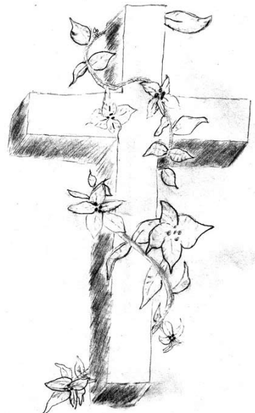
Rodger Verch III FDCF 2006